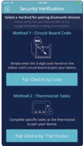
System Pairing Screen