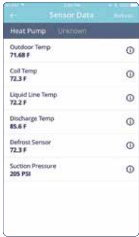
Sensor Data Screen

After downloading the app on a mobile device, a qualified service technician must register with business credentials. After registration is verified, the user may connect to the ComfortBridge technology control system by following the simple instructions provided on the app.